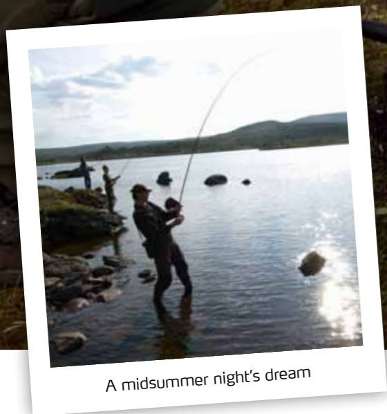
A midsummer night's dream