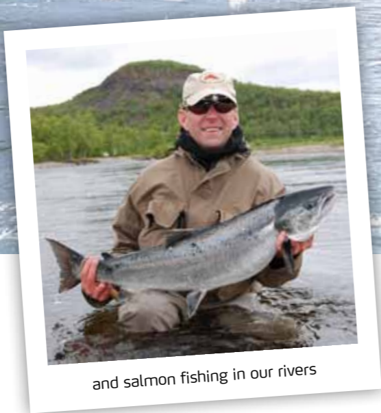
and salmon fishing in our rivers