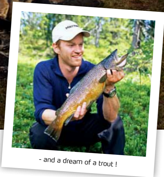
- and a dream of a trout !