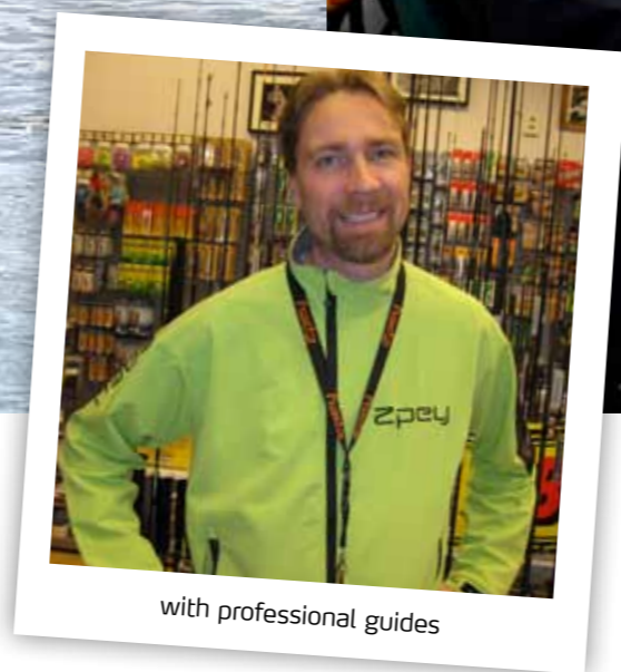
with professional guides