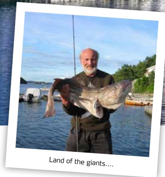
Land of the giants....