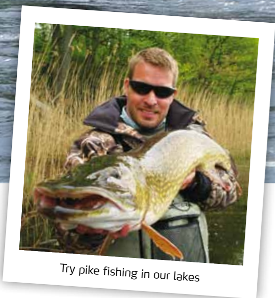
Try pike fishing in our lakes