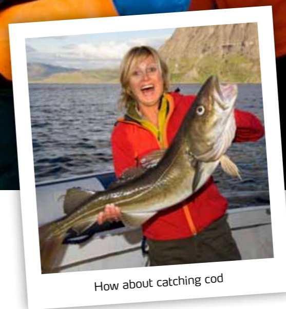
How about catching cod